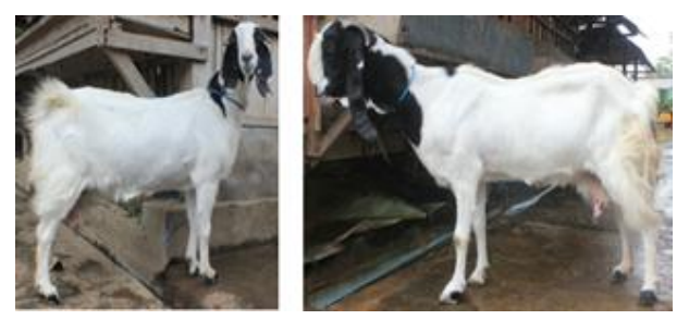
Fig. 3 Etawah crossbred goat from Batu City, East Java, Indonesia.

Etawah crossbred goat samples were measured based on approach of the characteristics of the Etawah pure line breed. Although slightly vary in hair color, but generally the dominant color is white (Fig. 3). Etawah crossbred goat generally has characteristics like the parental or Etawah pure line goats, which have a very curved nose (Roman face), short horns, long ears and white short hair except long hair at the back of the thigh and leg. For a female Etawah crossbred goat generally can have milked [13].