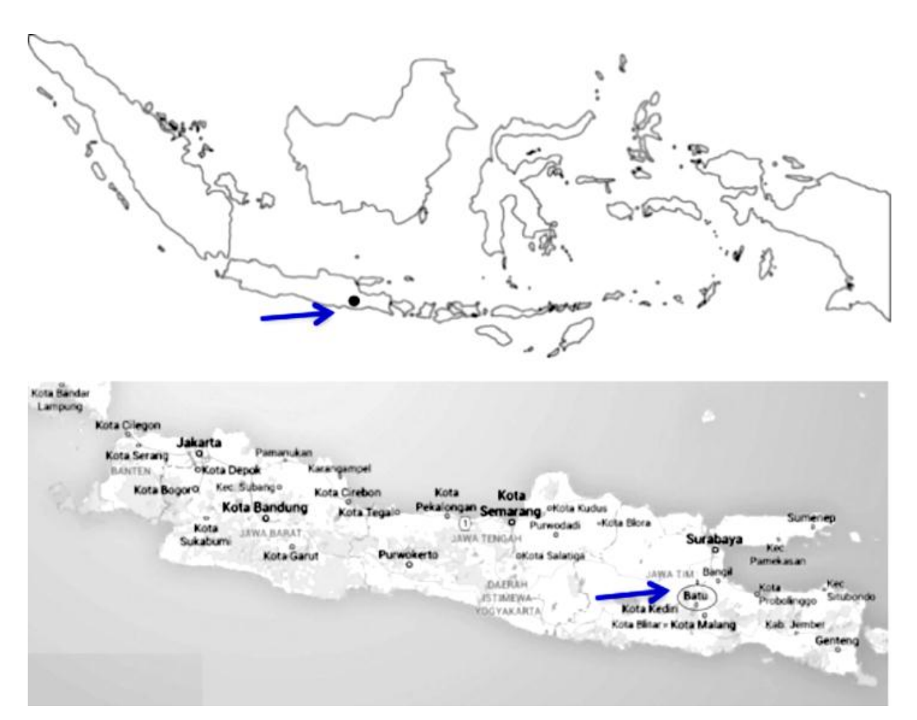
Fig. 1 Location map of the research. The arrow indicates the place of animal sampling.

purposive based on criteria of Etawah crossbred goat, such as convex face or Roman face, long ears and white hairs. The main equipment which used in this study included a measuring tape, measuring ruler, calipers, livestock scales, measuring beaker glass 1000 mL, test tube 100 mL, digital camera, hygrometer and thermometer.